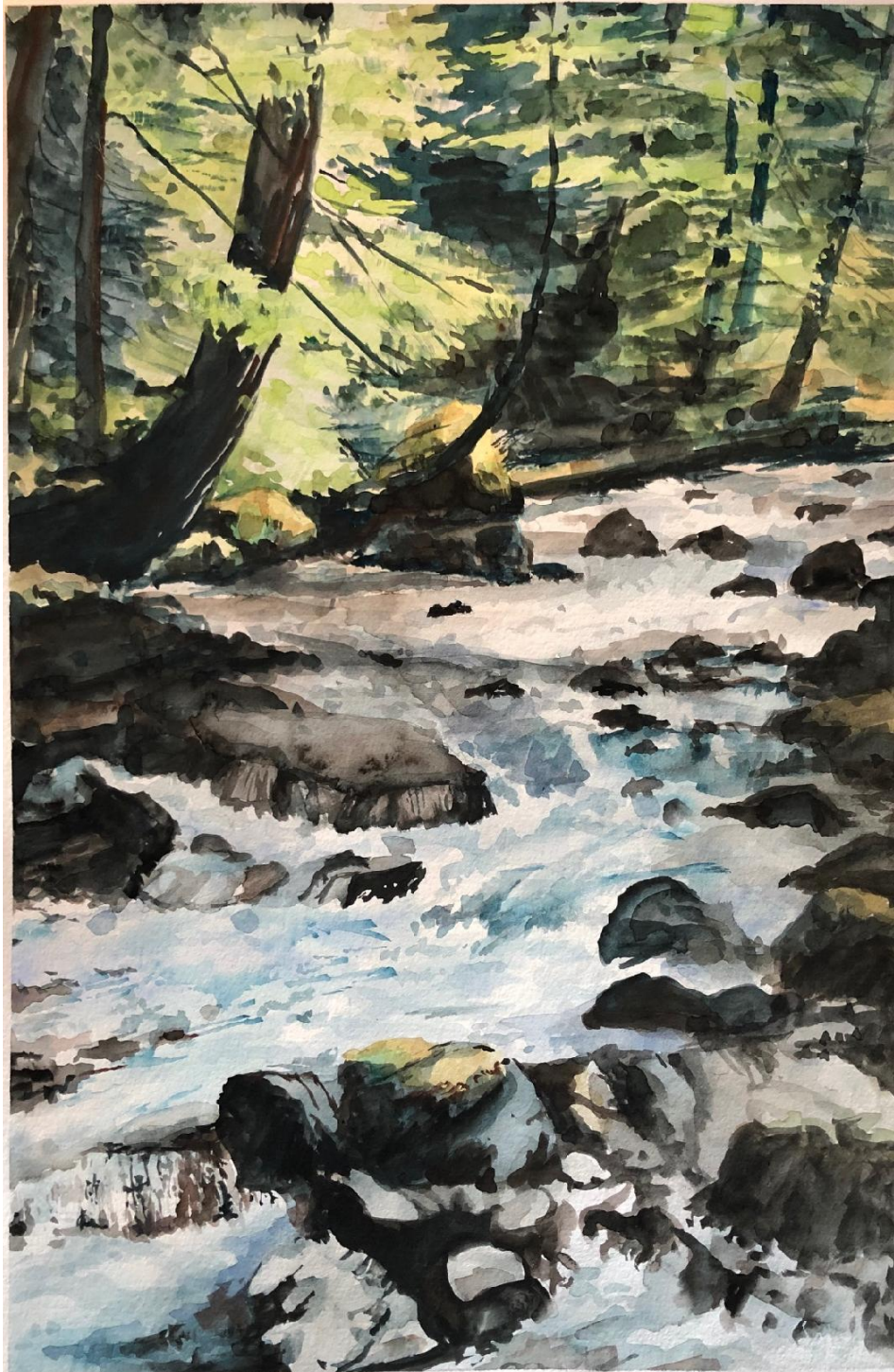
Upper Dungeness River